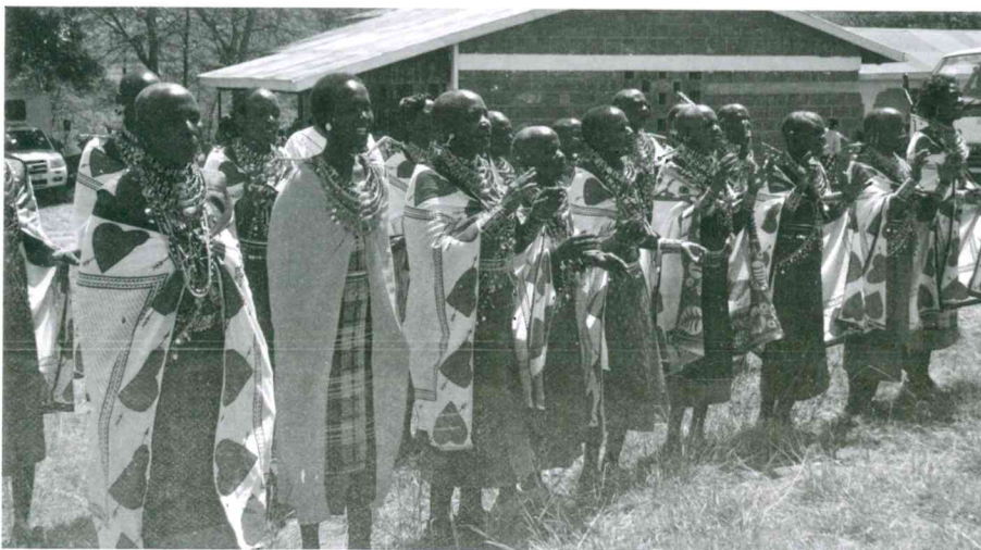
(Top) Representatives of CHAK, MEDS and Narok County Health Management Team (CHMT) in a group photo, during the launch of the SolarChill fridges distribution at AIC Olasiti Dispensary.